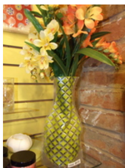
A U-M grad came up with the Say It With Vases line - they're small plastic bags.

TOUGH RUGS: Dorm room floors get pretty beat up - lots of traffic, food and drink spills, among other abuse. Downtown Home & Garden on Ashley Street sells plastic indoor/outdoor rugs that can take the heat. The $34 rugs by Mad Mats are surprisingly easy on the feet, durable, fade-resistant and are quick to clean, the store says. And environmentally friendly: They're woven with 98 percent recycled plastic and only need water and a mild detergent to mop up a mess.