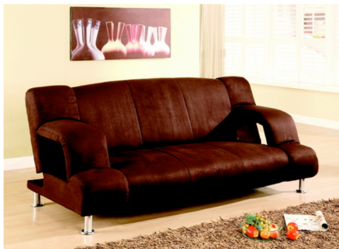
Doze off on a futon - Art Van has a comfy Click Clack line.