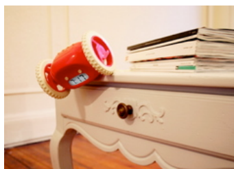
Rely on The Clocky alarm clock to wake you up. You hit snooze once; after that the Clocky will jump up to 3 feet off your nightstand and roll around the room, squealing and flashing until you get up and turn it off.

WAKE UP NOW: A company called Dormbuys.com sells a gadget that's especially for those who have trouble getting up for class in the morning. The Clocky alarm clock "runs away and hides when you don't wake up," according to the Web site. You set it to let you hit snooze once, then after that the Clocky will jump up to 3 feet off your nightstand and roll around your room, squealing and flashing until you get up, find it and turn it off. It comes in a handful of colors and sells for $49.99.